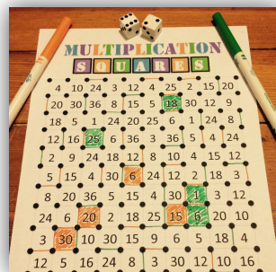
We've "Mathified" The Squares Game